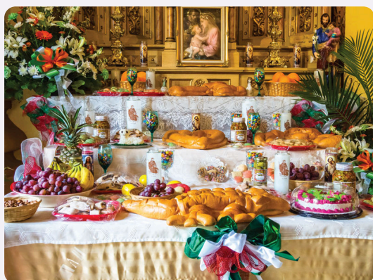
St. Joseph Table